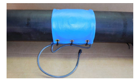
Install Treatment Pads Opposing Each Other with labels "To Pipe" facing the pipe.